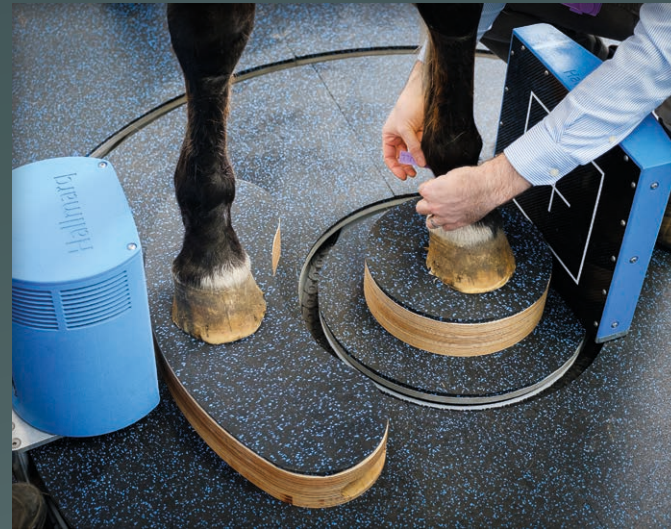
Positioning the patient

Q-Care customer support is designed to help minimize the risks commonly associated with implementing a new service.