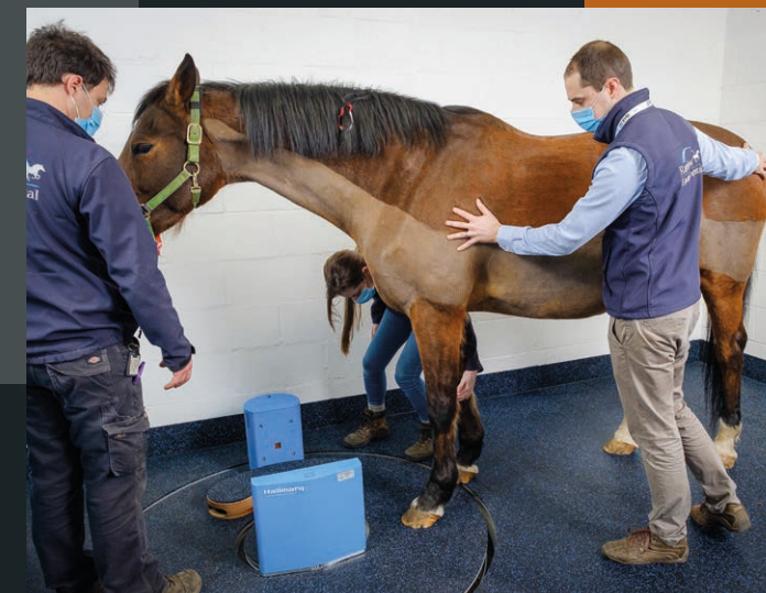
Walk-in design for patient safety